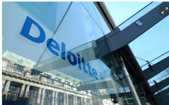
Deloitte provides auditing, tax consultancy and cybersecurity advice to banks, multinational companies and government agencies.

One of the world's "big four" accountancy firms has been targeted by a sophisticated hack that compromised the confidential emails and plans of some of its blue-chip clients, the Guardian can reveal.